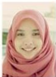
Mariam Settas Ealing Centre (London)