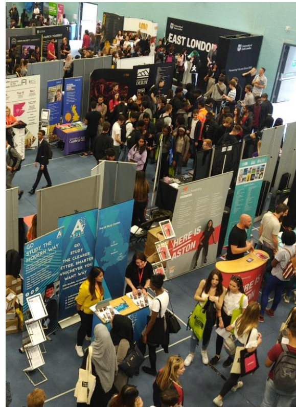
UCAS Undergraduate Open Day in London, June 2019

Natale and Doran (2011) warn about the 'fast-paced' turnover of students and recognise the role of the business environment within the process. It is argued that the impact of the business world on HEIs may distort their traditional intrinsic values. Students tend to be required to be more pragmatic in their thinking rather than logical thinkers in pursuit of knowledge for its own sake. Molesworth, Nixon and Scullion (2009) argue that the student is focused only on content which relates to future employment. According to Natale and Doran (2011), education is now considered to be a 'marketing commodity' and one that leads to individual profit. Does such a perspective then lead to moral obligations on the HEIs to inform students of the limitations of a course? A further challenge for HEIs is understanding the actual place and methods of pedagogy to either support these views of education or to enhance education in order to maximise the students' experiences and develop their knowledge with a view to encouraging their lifelong learning.